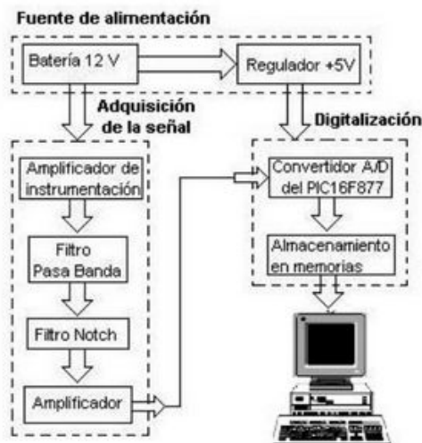
Figure 1. Diagram of blocks of a Holter monitor, taken from [3]

to 7 shunts and 3 to 12 channels [1], this device has an approximate dimension of 70x95x20 mm; Weight, \approx 190 grams [2] the signal takes a pass through filters system type that rejects band and passes other ones to separate the important information from the noise, It is accompanied by an amplification stage so that the information obtained can be observed, since these signals are in millivolts, at the end of this stage there is an analog-digital converter which is in charge of the discretized signal Which is stored in a memory, usually flash-type or SD, which has a specific format in some cases.