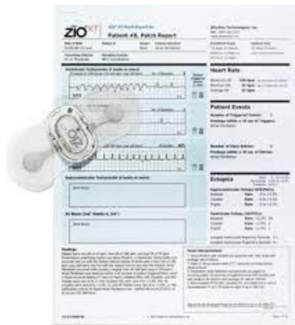
Figure 2. Patch Holter ZIO of the IRhythm and its diagnosis sheet (image taken from [14]).

Among the devices that have obtained a greater recognition, it is counted with ZIO, of the IRhythm [13] company, which is non-invasive, with less size than 10 centimeters and with a 92 possibility of detection of different types of illnesses that compared with the Holter monitor that can only detect 61. In addition, people who have made the test confirm that they find the patch more comfortable in a 93.7% and Superior in an 81% in comparison with the Holter monitor [10], one of the main advantages of this device, is that it is unnecessary to keep a diary, it combines the detection of a Holter device with a detector of an event, since the patient can press a button when he/she feels any inconvenience and the system will mark that time to be studied later, the common point that they have is that their diagnosis is delivered after being returned the device to the manufacturer which is responsible for conducting the analysis, But the device manufacturer delivers the diagnosis within one or two days through a Web page. Figure 2 shows the ZIO device and its result sheet sent by the web to patient. over a patient's internet.